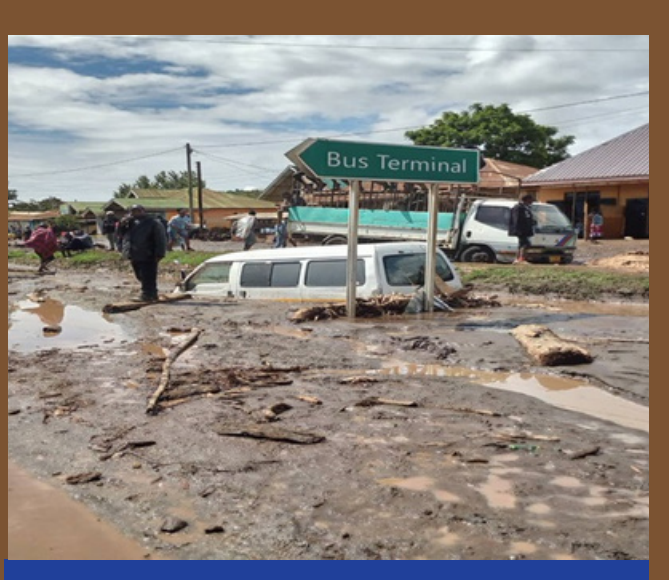
Severe flooding and landslides near the slopes of Mount Hanang in the Manyara region. Dec. 3, 2023.

The sad events in Hanang district, Manyara region in Tanzania, tell a story that goes beyond the town's borders – it's a story about how our changing climate can bring unexpected disasters. Hanang, once a quiet and pretty place, recently faced a terrible night when floods came without warning, taking 89 lives, including 36% who were children.