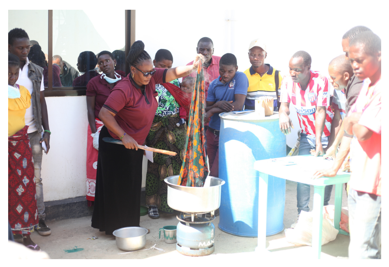
Mbeya, June 13, 2023

The beneficiaries of the Passport to Coffee Export (PACE) project facilitated by the Envirocare organization are experiencing renewed happiness and fresh economic prospects in their lives after being empowered with skills in making batik and soap, as a means to improve their economic status.